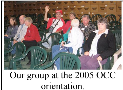
Our group at the 2005 OCC orientation.

Region Warehouse on 29 November along with the hardy volunteers. The center in Santa Ana processed over 400 000 shoe boxes last year with boxes going from this center to these eight countries: the Philippines, Panama, Mexico, Nepal, Bangladesh, China, Indonesia, and Sri Lanka. I would expect have a larger number of boxes this year than last year’s total. Thank you to all of you that took the time to purchase, pack, and wrap boxes to bring joy to God’s children.